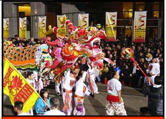
San Francisco's Chinese New Year Parade 2002

The Lunar New Year is an important tradition of many Asian cultures. It is a time of celebration and an opportunity for new beginnings. The first new moon inspires traditions to create good fortune for the upcoming year. Elaborate meals, new clothes, making amends, repayment of debts, and cleaning your home are just a few of customs to create positive energy for the upcoming year. Many people are familiar with Chinese New Year, but other Asian groups also observe Lunar New Year as an important element of their culture. Koreans celebrate Seol-nal and Vietnamese Tet-Tet Nguyen Dan. In the San Francisco Bay Area, with its large Asian population, Lunar New Year celebrations are common and welcome events. San Francisco has the largest celebrations with the annual Chinese New Year Parade and Festival. The parade is the largest of its kind in North America. San Jose has a large Tet-Tet festival and Seol-nal is celebrated in many Bay Area communities. In the spirit of the new Lunar New Year, KTSE wishes all of our clients and friends prosperity and wealth for the upcoming year. Gung Hay Fat Choi!